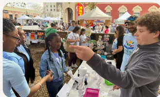
Vermilion Student Arts Expo Downtown was filled with art, music, and local talent during the expo.