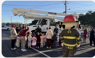
Career Day at Vermilion Catholic Students had the opportunity to learn about careers in public service.