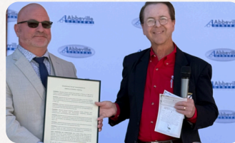
Abbeville General Hospital 60th Anniversary The City of Abbeville joined Abbeville General Hospital in celebrating 60 years of service to the community.