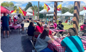
Sicilian Celebration Heritage and culture were celebrated in downtown Abbeville during this annual event.