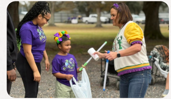
Head Start Mardi Gras Parade Head Start families celebrated Mardi Gras with a parade at A.A. Comeaux Park.