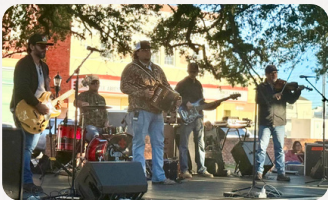
Sounds on the Square Live music returned to Magdalen Square for the spring concert series.