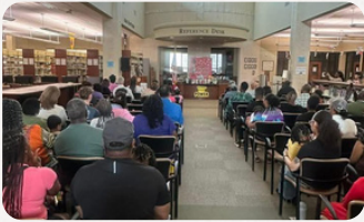
Black History Program at the Library The community gathered to honor and reflect on Black history, culture, and achievements.