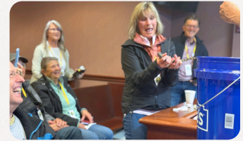
Cajun Caravan Visit Visitors stopped in Abbeville to learn more about Cajun culture, history, and local traditions.