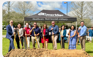
Eastridge Expansion Groundbreaking Leaders and community members gathered to celebrate the start of the Eastridge expansion project.