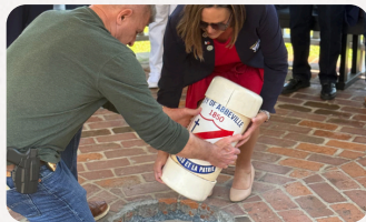
Time Capsule Ceremony City buried the time capsule as part of the City's 176th anniversary of incorporation.