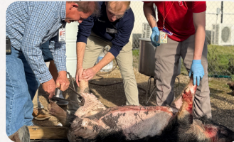
Abbeville High Boucherie Students helped keep a long-standing cultural tradition alive through hands-on learning.