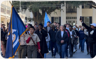
MLK Celebration The community gathered downtown to honor and celebrate Dr. Martin Luther King Jr.

Over the past three months, Abbeville has stayed busy with events that celebrate our culture, creativity, and community spirit. Each event represents just a glimpse of the many ways our community continues to connect and celebrate together.