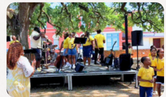
Spirit Fest Families gathered at Magdalen Square for food, music, and community fellowship.