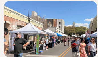
Vermilion Arts Council Art Walk Local artists and vendors filled Concord Street as the community gathered for the Art Walk.