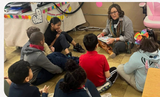
Read Across America The Mayor spent time reading with students at James A. Herod Elementary during Read Across America.