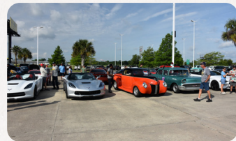
Crusin' Cajun Country Crusin' Cajun Country came to town to show off their cool cars and raise some funds!