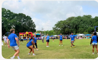
Volleyball Jamboree The Volleyball Jamboree at AA Comeaux Park was a day of bringing people together for a great cause.