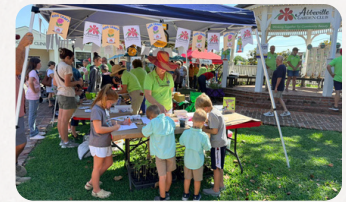
Daylily Festival The Daylily Festival gives Abbeville a day to enjoy beautiful flowers and local charm.