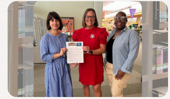
National Library Week Mayor White highlights the importance of reading by declaring National Library Week.