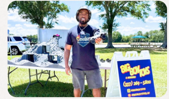
BashSquadaThon The first ever BashSquadaThon brought a great mix of competition, community, and fun to Lafitte Park.