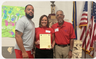
Abbeville Highschool Day Abbeville High Day is honored for the school's 124 years of excellence in education.