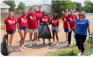
Love the Boot Week Abbeville's Mayor's Youth Council and community members help cleanup our city.