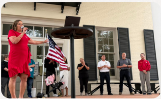
National Day of Prayer The Abbeville community came together in a powerful day of prayer and unity.