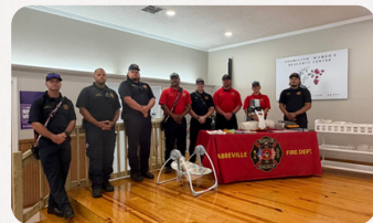
Community Health Event Residents and families gathered and were offered free health, safety, and educational resources from local organizations