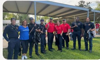
Community Cleanup Day Abbeville community comes together to help cleanup our beautiful city.