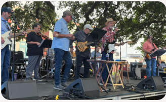
Sound on the Square Live music returned to Magdalen Square for a finale to the spring concert series.

Over the past three months, Abbeville has stayed busy with events that celebrate our culture, creativity, and community spirit. Each event represents just a glimpse of the many ways our community continues to connect and celebrate together.