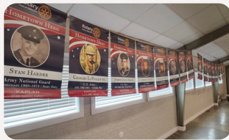
Hometown Hero Banners Rotary Club honors those in Abbeville who gave their lives for our country by hanging banners around the city.