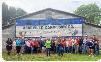
Richard Barn Reopens Richard Sale Barn is officially back open, now a place for live music and fun events.