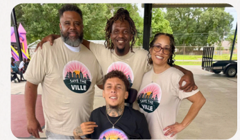
Save the Ville 2nd Annual Save the Ville Homecoming Community Day at McKinley Scott Park.