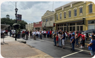
Vermilion Parish War Memorial Our war Veterans were honored in a ceremony right in the heart of our community.