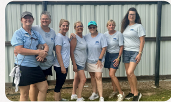
Spring Carnival Junior Auxillary puts on a fun carnival offering an afternoon of activities for families.